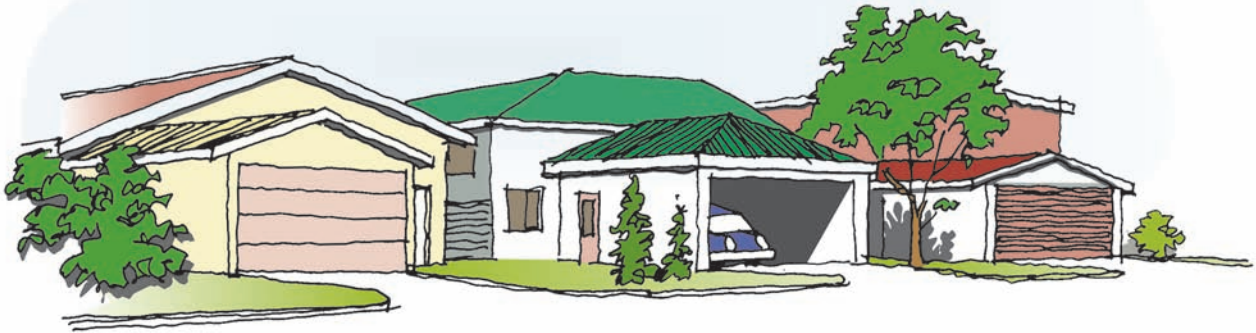
Garages dominating the street and reducing pedestrian safety